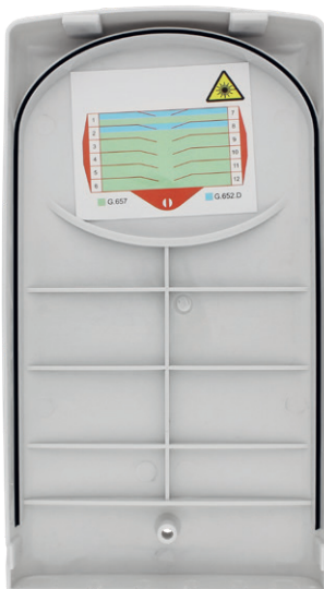
SDU-Wallbox-SP-S-empty Cover inside