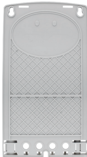
SDU-Wallbox-SP-S-empty Rear side