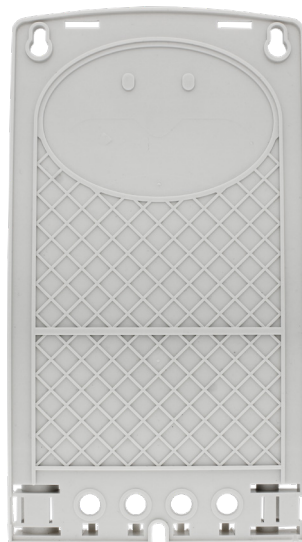
SDU-Wallbox-SP-S-empty Rear side