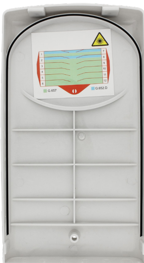
SDU-Wallbox-SP-S-empty Cover inside