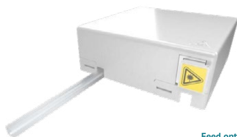
Feed options compatible with the WAVEPACE® Silway system