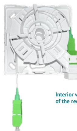
Interior view of the reel system